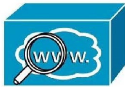
Web Security Appliance