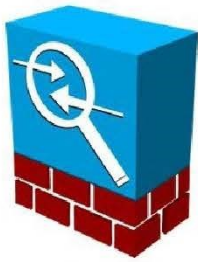
Adaptive Security Appliance