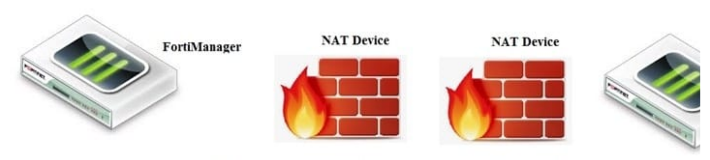
FortiManager NATed IP address